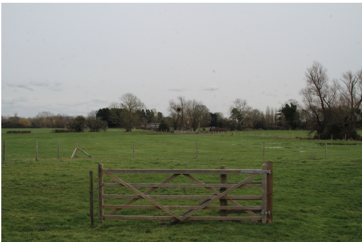
The principle view east from the green just outside the barn – the proposed guided bus route will be highly visible as just beyond the open hedgerow in the middle distance together with existing farm building, Manor House (off Waterbeach Road) is mostly screened by evergreen and deciduous trees (image taken on 15 March 2023).