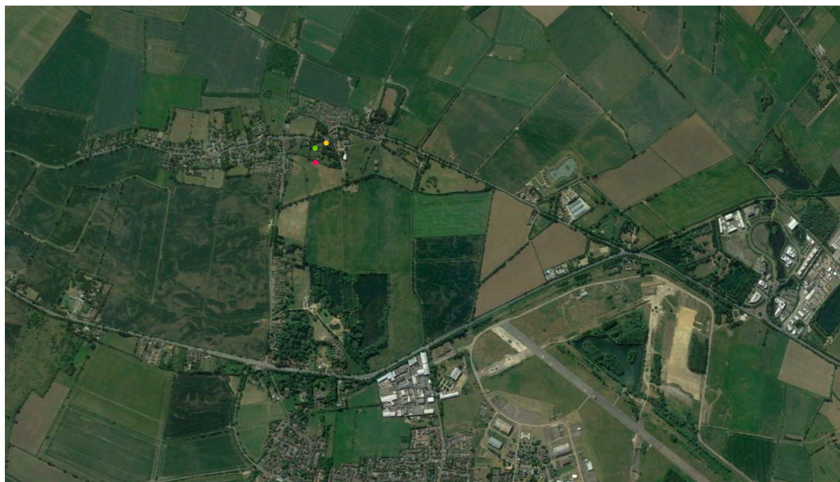
Aerial map of Landbeach

KEY: ● Tithe Barn ● Old Rectory ● All Saints' Church