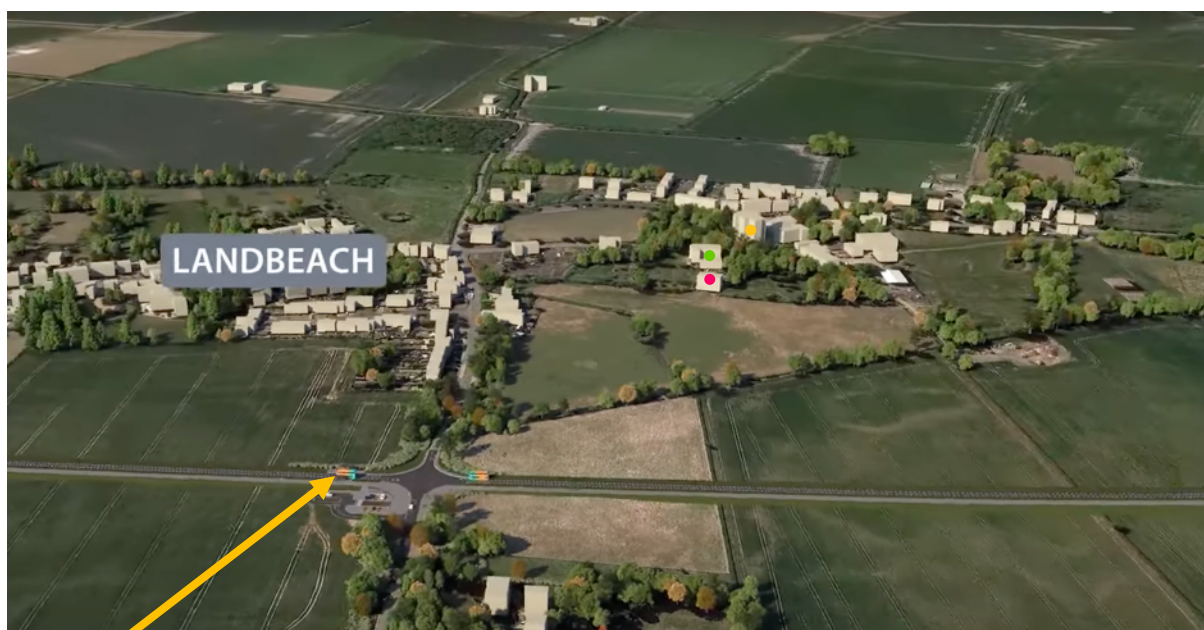
Proposed central Guided Busway route and interchange (south of Waterbeach Road)

KEY: ● Tithe Barn ● Old Rectory ● All Saints' Church