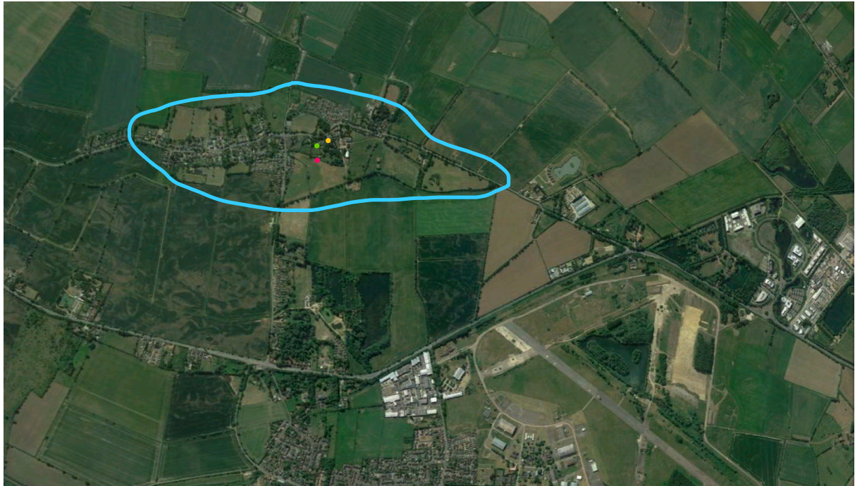
Aerial map of Landbeach