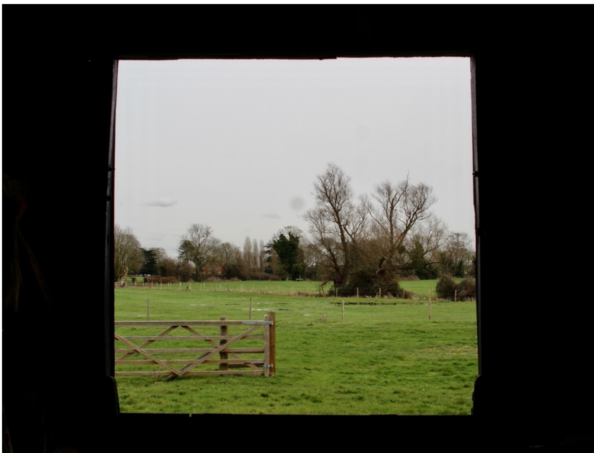
The principle view east from within the barn – image taken on 15 March 2023