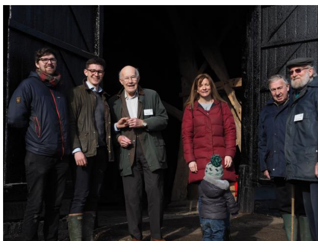
Key handover celebrations February 2020