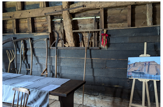
Clockwise from left: a dinner gathering as part of our Annual General Meeting; surveying activities at Archaeology Day; displaying historical tools at Heritage Open Days.

In 2024, the barn hosted the first Scouts Archaeology Squad's Archaeology Day, offering training to volunteers hoping to host activities with their Scouts. This new group is working to build relationships with historic sites and museums across Cambridgeshire, and we are pleased to be partnering with them in this effort.