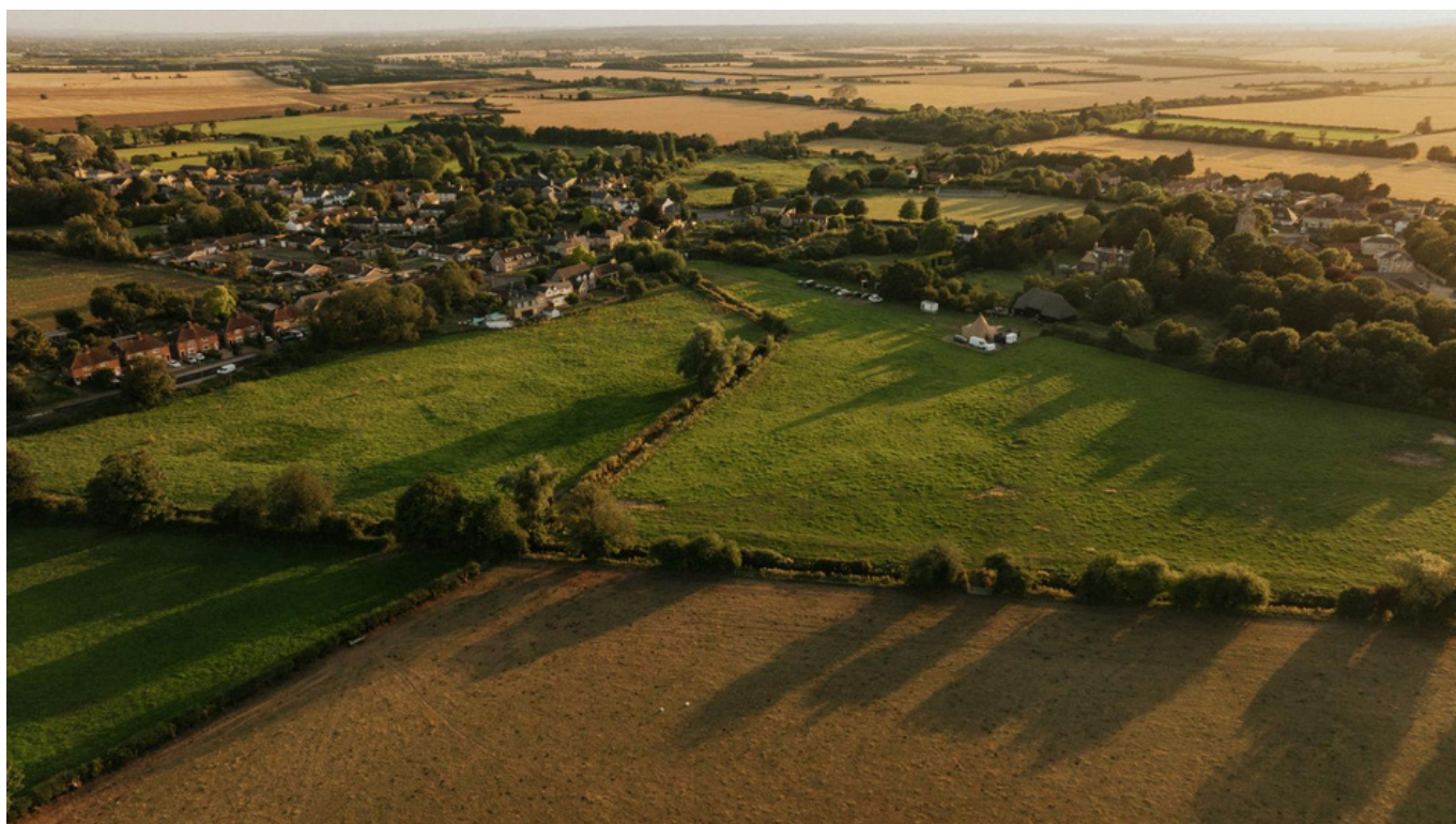
Aerial photos of the Tithe Barn.