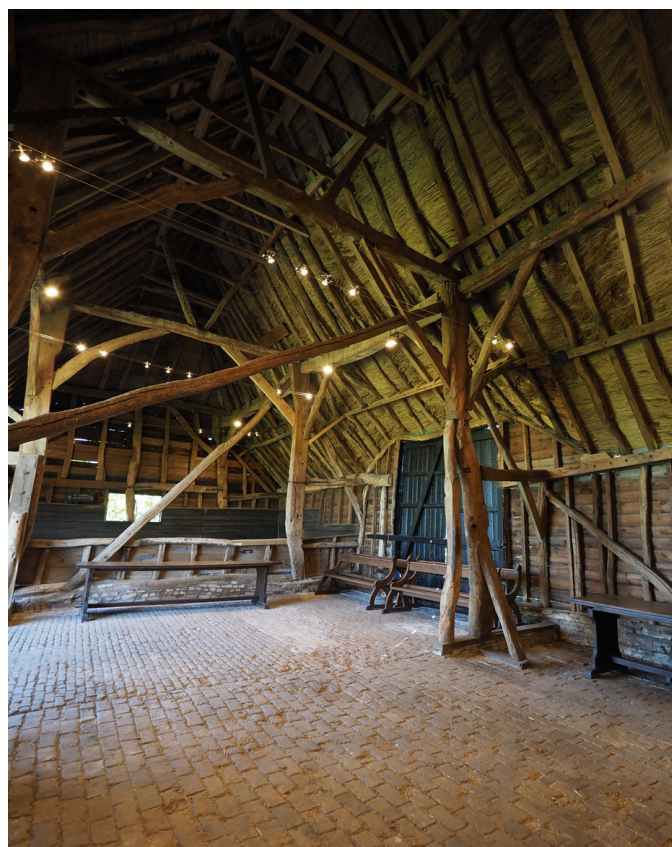
Left: The eco-loos, installed in 2022. Right: Interior of the barn with current lighting, which at this time is run by generator.