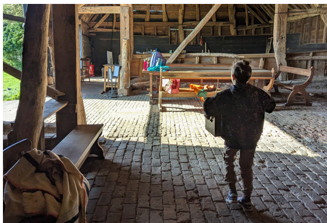
Above: volunteers – young and young at heart – hard at work during our Outdoor Maintenance and Annual Barn Clean days.